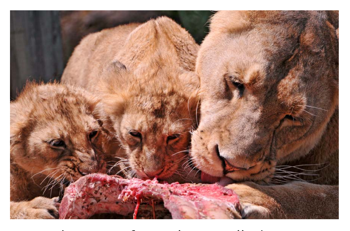
I get hungry after playing all day. I like to eat dinner with my family.