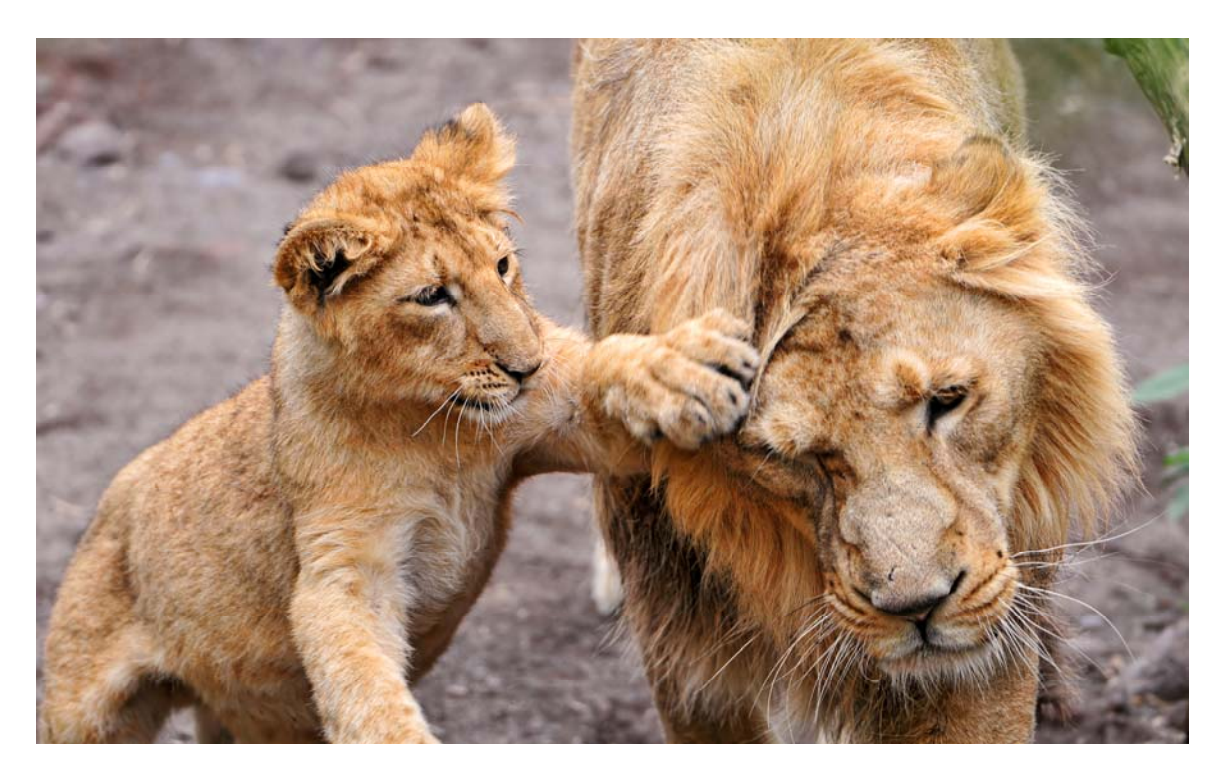
I like to play with my dad, but I think he lets me win.