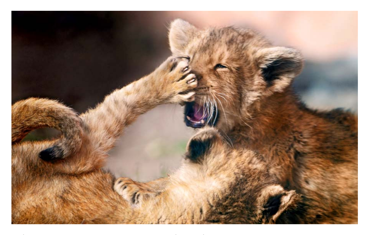
This is my sister. She hit me on my nose — ouch!