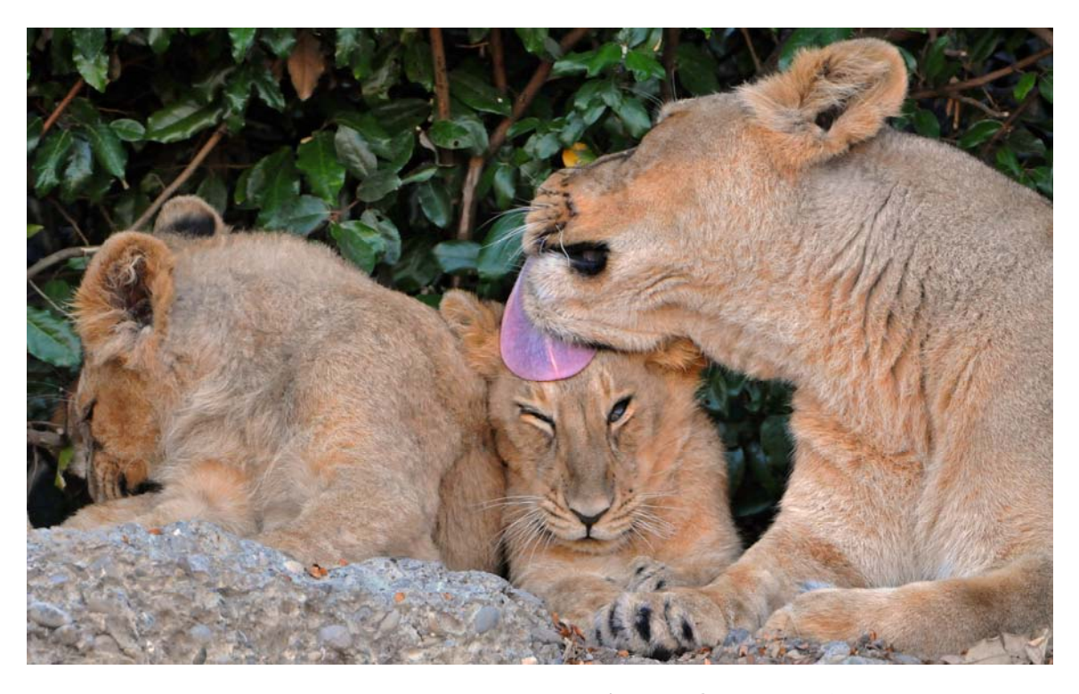
My mom gives me a bath after dinner. I hate it when I have to get a bath!