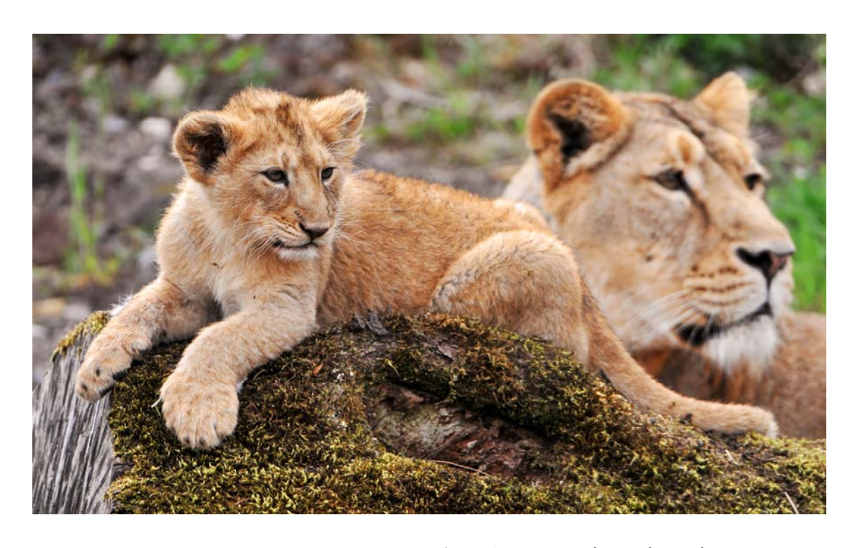
My name is Timba and I'm a little lion. I live in a zoo in Switzerland.