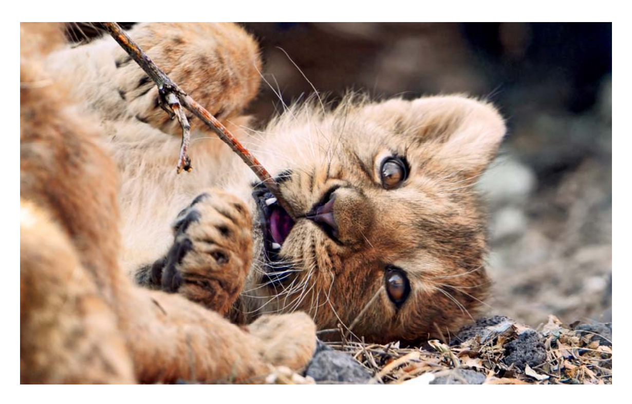
I like to lay on the ground and chew on stuff like this stick.